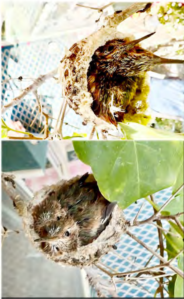
Richard Buck says their hummingbirds are growing up