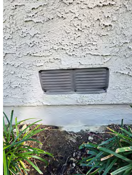
Attic and garage vents with 1/16" screens installed by Blaze Blockers.

Tony's 1/8" installs can be seen on homes once he begins the installs this week.